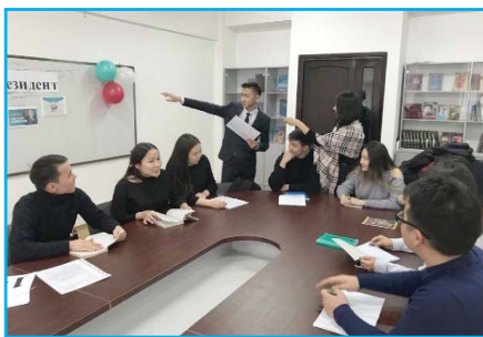
Intellectual game «Let's brainstorm»