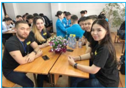
Republican contest «Criminalist - Expert»

In addition to the academic training of students, the Faculty focuses on the development of a full-fledged person in society. It is proved by student organizations such as the "Legal Clinic", the "Student Council", the "Senate of Students", the "Sunkar", the "Komek" and the traditional social-educational activities.